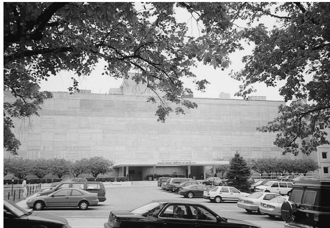
The concealed nuclear storage at the AFIP

As is clear from U.S. government documents, atomic bomb materials have never been used for the development of medical treatment or to help A-bomb survivors. The materials have not been used for mankind. Were the A-bomb survivors treated as guinea pigs in experiments? We can imagine that some scientists engaged in the studies suffered internal conflict in this regard. Taking into account the purpose of the ABCC, the whole concept of the organization, and the nuclear shelter where collected data was kept, one can say that atomic bomb material was collected and used for military purposes. A-bomb survivors were treated as subjects (objects, really) from which to gather the data.