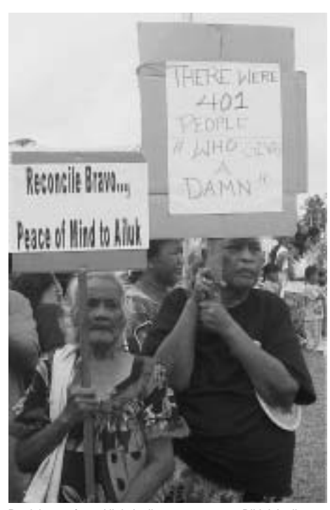
Participants from Ailuk Atoll at ceremony on Bikini Atoll on March 1, 2004.