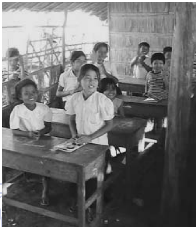
Cambodian children at an elementary school in a village near Thai border in January 2003.

The issue of landmines, used so commonly during the civil war and once numbering as many as 5 to 10 million, has recently become somewhat less serious with the marking of all the hazardous zones. Complete demining will take half a century or more, but the incidence of annual casualties caused by the landmines is falling significantly.