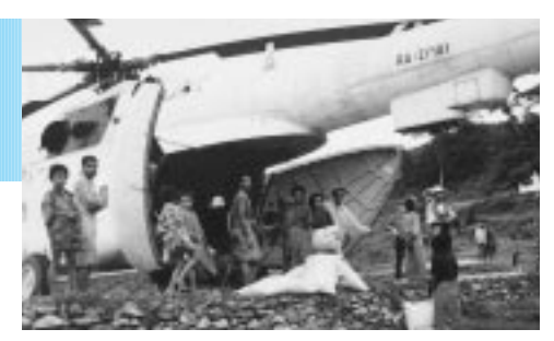
Relief goods are unloaded from a helicopter in a mountainous area of East Timor.

time. However, whenever I witnessed people returning safely to their villages and tearfully embracing relatives, with expressions of relief and smiles on their faces, I felt keenly aware of the importance of